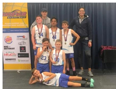
NIS Bulls North Harbour League 3 Champions

I would like to wish all of our Community a safe and happy holiday and look forward to another exciting term with well rested staff and students.