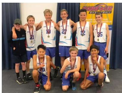
NIS Vanguard North Harbour League 1 Champions